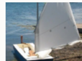
The Oz Goose is ideal for Taal Lake.

Name sponsor for the event, plus your logo in all materials, press releases, mentions in all radio guestings and press coverage, event registration and tarps for the event as well as mentions in the program for any news coverage. One boat that will have a dacron sail bearing your company name to be deposited at TLCC for the benefit of a partner family and TLCC. Your logo will also be on the ramp and boathouse.