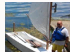
Some of the first Oz Geese, this was taken at TLYC

Includes your logo in all materials, websites and web releases, press releases, event registration and tarps for the event. Funds will be used to repair the boathouse and ramp and your logo will be on one of these. Only TWO spots for gold sponsorship.