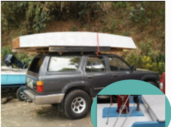
Easy to rig, will not sink if capsized, and can be carried on top of a car.

Want a boat but can't afford it? Build One! it's easier than you think! This is the adage of the Philippine Home Boat Builder's Association and as an organization for the conservation of Taal Lake, Pusod decided to partner with them to enhance water sports and boat building in the eastern part of the lake to encourage non-motorized boating and the involvement of locals in sailing.