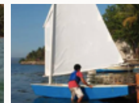
IT can easily be handled even by kids